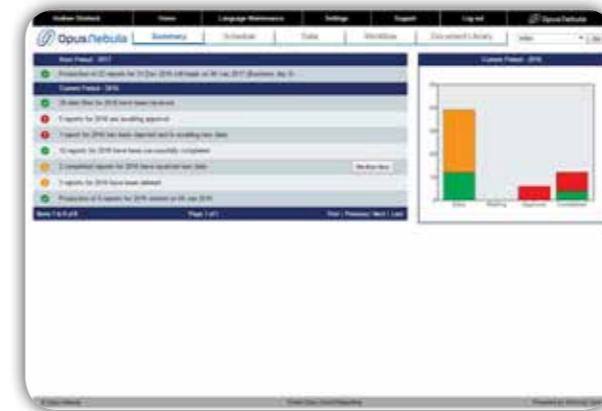
Report page summary