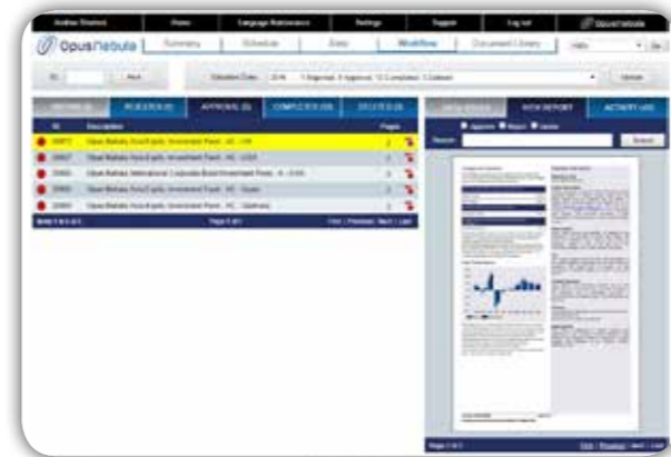
Simple and powerful workflow