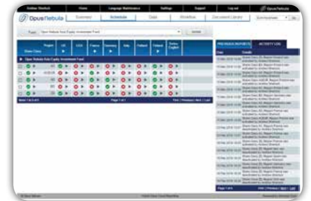
Schedule reports as and when you need them