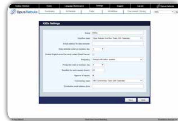
Dynamic report settings