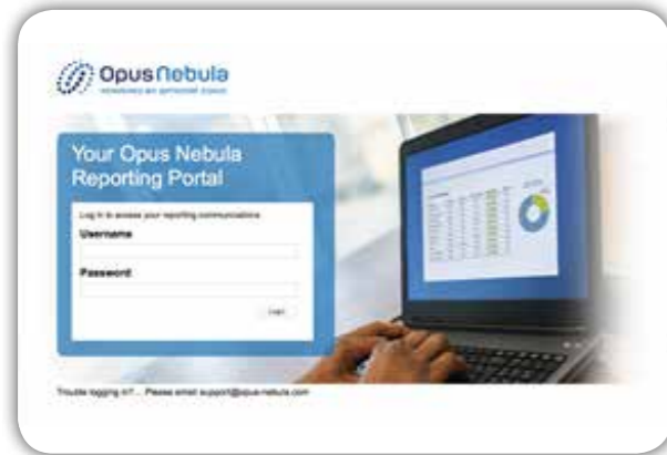
Secure entry system to the reporting portal