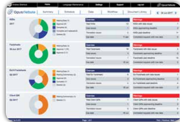
Intuitive management dashboard